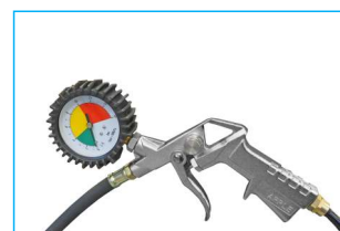
Gun with pressure gauge