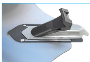
Additional jaws slides