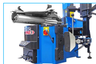
Strong bead breaker with a force of 3 tons