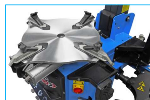
Profiled assembly table from 10" to 24"