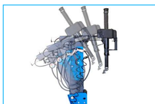
Pneumatically tilting column wider at the base