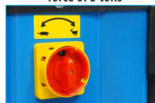
Double speed rotary table, controlled in a switch