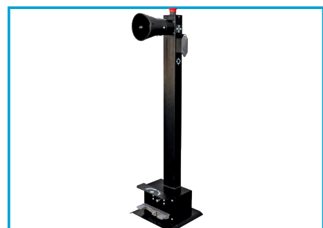
MOBILE WIRED CONTROL UNIT