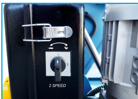
TWO SPEEDS OF THE HEAD